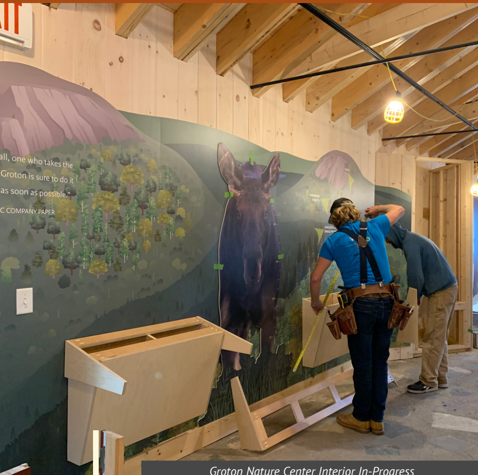
Groton Nature Center Interior In-Progress

Learn more about this partnership by visiting our website .